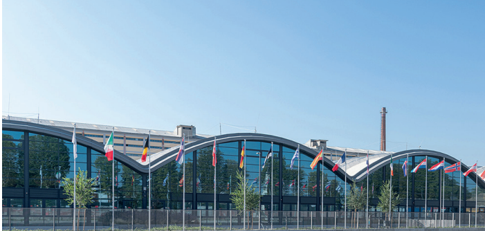
Figure 1 The new data centre in Bologna.

In June 2021, partial handover from the region to ECMWF took place. This enabled the Centre to have control of systems and processes, ensuring managed resilience to the data centre, whilst ECMWF continued its installation of information and communications technology (ICT) systems and the start of the HPCF build in Bologna. During September, the data centre was formally opened by representatives of ECMWF and the Italian authorities.