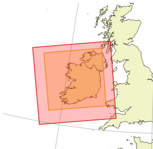
Figure A: Possible 750m resolution domains over Ireland, using 800x800 (red) and 600x600 (orange) grid-points.

The aim of continuing this project will be to test an hourly nowcasting configuration of HARMONIE-AROME for Ireland at a high resolution, ideally at sub kilometre resolution, such as on the 750m test domains shown in Figure A below. This will build upon the work my colleague Colm Clancy performed under his 2021 special project "Investigating the optimal configuration of the HARMONIE-AROME NWP model for hectometric-scale forecasting over Ireland".