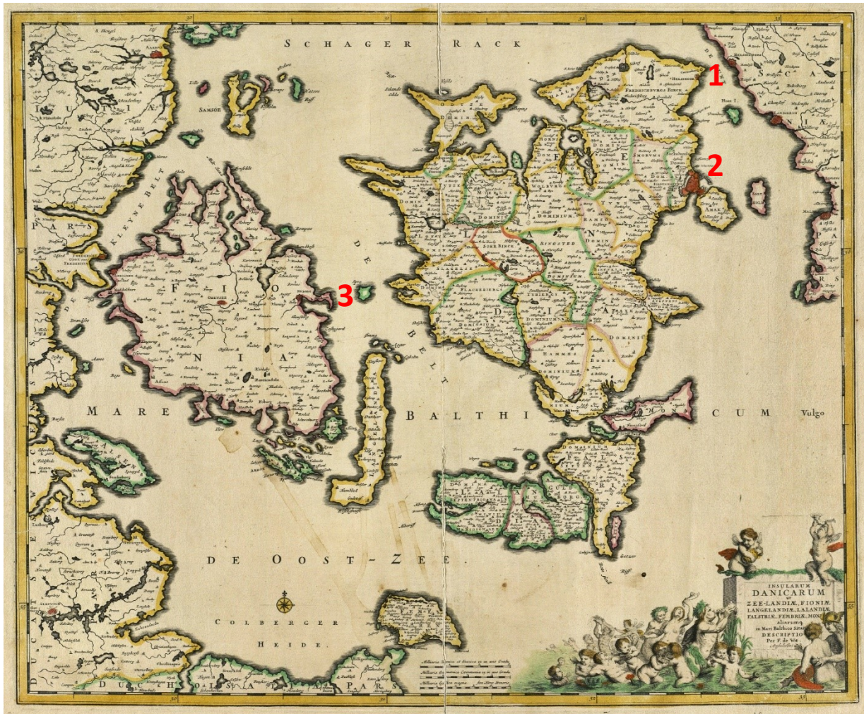
Figure 1: Frederick de Witt: Insularum Danicarum ut Zeelandiæ, Fioniæ, Langelandiæ, Lalandiæ, Falstriæ, Fembriæ, Monæ aliarumq. in Mari Balthico sitar (Map of the Danish islands, namely Sealand, Funen, Langeland, Lolland, Falster, Fehmarn, Møn and others); Amsterdam 1670. Royal Library. Locations of war ships on duty are marked off Helsingør (1), Copenhagen (2) and Nyborg (3).